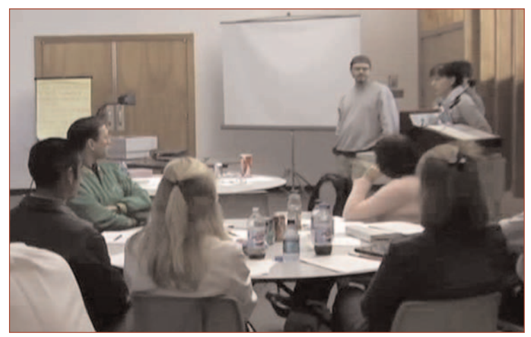
Spring 2006 cross-CLIP meeting

"I wanted to work with my colleagues to accomplish a big task that had been on the back burner for a while. The funding allowed us to make the task a top priority.'