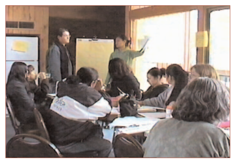
Members of Transitions CLIP at January 2006 meeting

CLIP members focused on the question "What can students learn about making successful transitions from a community college to a four year institution by attending professional conferences, visiting college campuses, surveying students, and studying college websites?" To answer this question, they met frequently, gathered data while