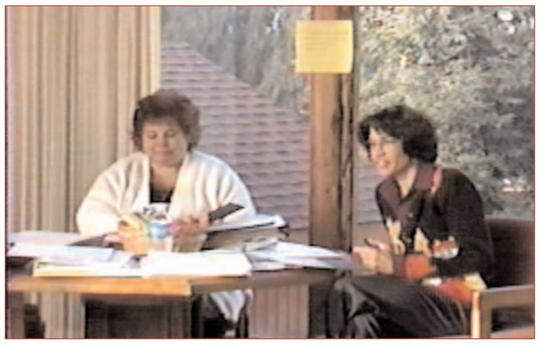
Members of the Developmental Writing CLIP at January meeting

The CLIP decided to see if students in English 60 would perform better if they received personal attention from their composition instructor. The CLIP's study required students in eleven English 60 classes to submit letters to their instructor on assigned topics and to participate in conferences with the instructor. The topics were about issues of importance to the students.