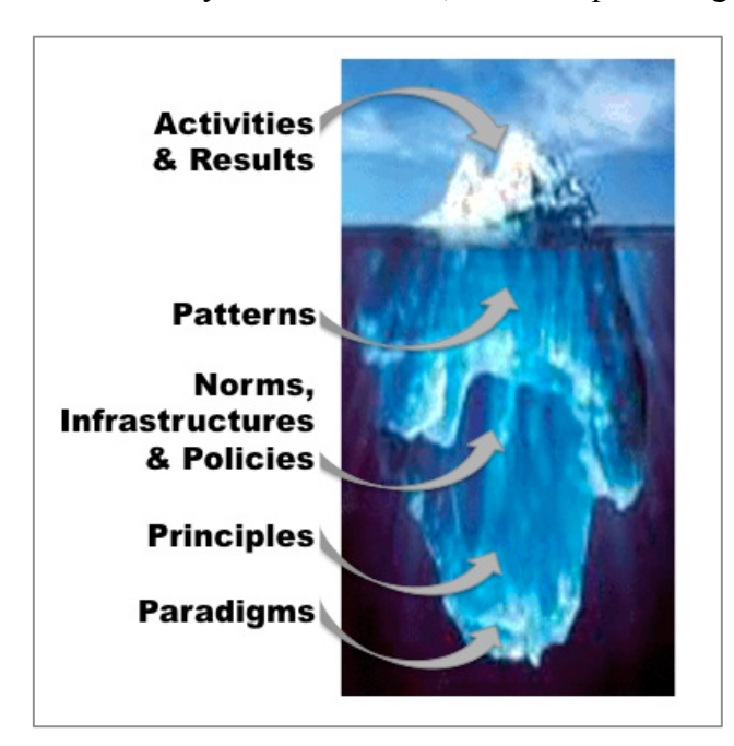
Illustration of Visibility and Depth in Complex Systems

The purpose of looking below the surface is to determine leverage points—places in the system where a small change can lead to a large shift in behavior. By identifying potential leverage points, the evaluator can assist the STEM¹ education initiative in how to take action to efficiently move toward their desired outcomes. The deeper you go in the iceberg, the more effective the shift is likely to be. However, those deeper changes often are more difficult to accomplish.